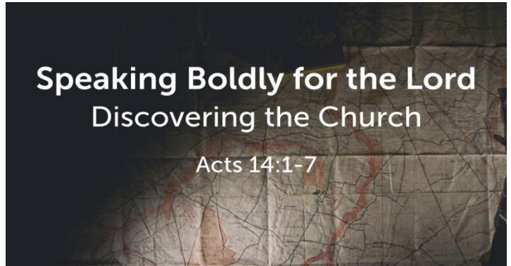
click graphic for presentation 1of sermon from June 7, 2017

2 But though we had already suffered and been shamefully treated at Philippi, as you know, we had boldness in our God to declare to you the gospel of God in the midst of much conflict.